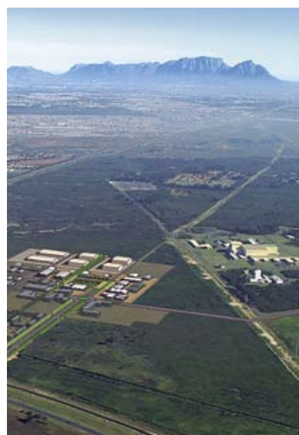
Aerial view of Cape Town Film Studios development.

Studio access is very important in film making as it provides the film maker with a totally controllable environment. When directors work with international stars, tight time frames and budgets, filming in studios becomes vital for keeping the film on track.