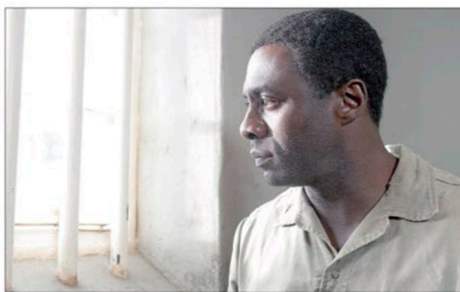
MANDELA MOVIE: Idris Elba as Nelson Mandela in Long Walk To Freedom .

British actor Elba flew into the city this week for the shoot. And actress Katheryn Winnick, who stars in the TV series Vikings , posted a picture of herself on the set