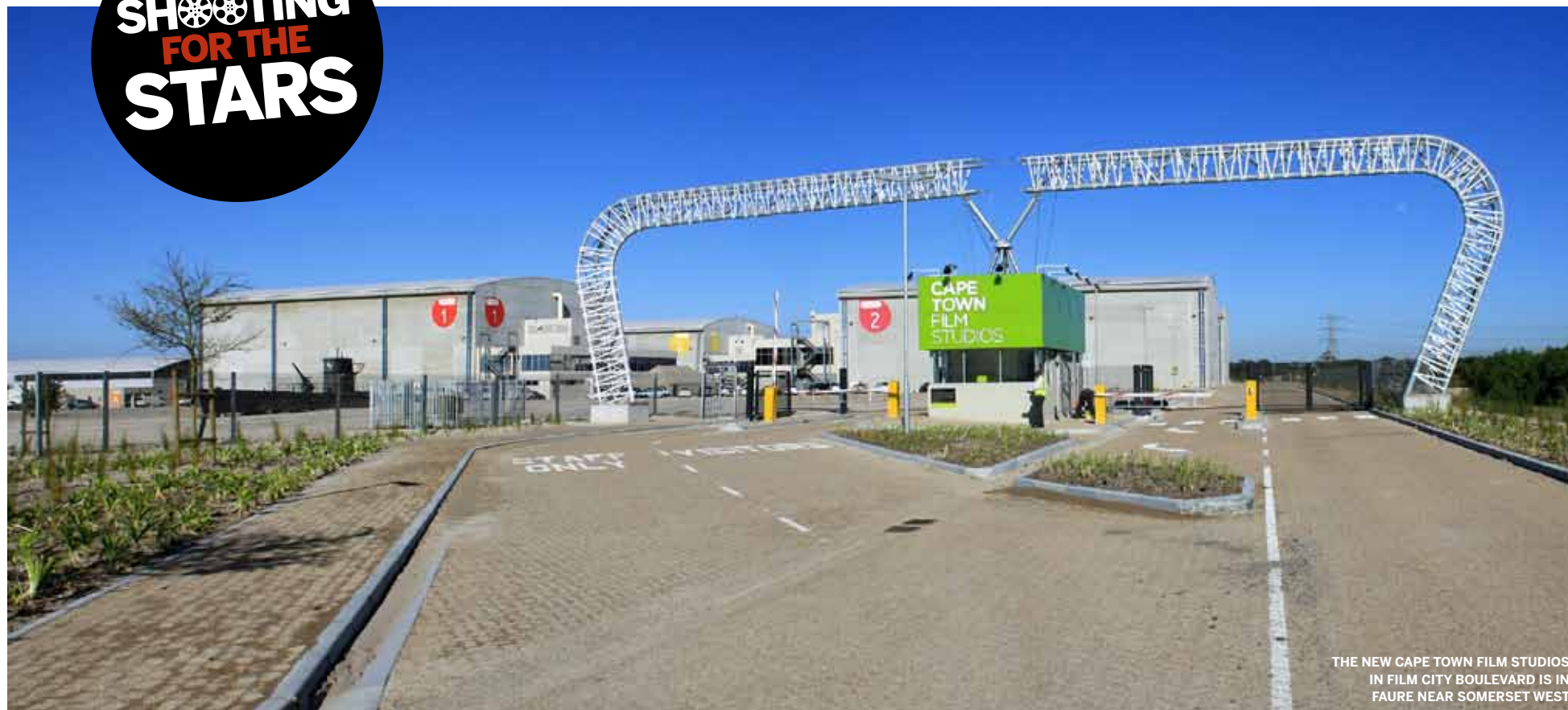
THE NEW CAPE TOWN FILM STUDIOS IN FILM CITY BOULEVARD IS IN FAURE NEAR SOMERSET WEST

being shot on location, using part-time warehouses to shoot some elements indoors. Now we attract a different film, a more hi-tech manufacturing movie where the filmmakers stay in the country longer. They shoot for the full duration – you build everything here, you shoot it here and you use